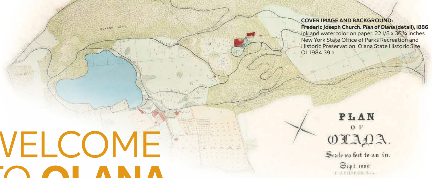
COVER IMAGE AND BACKGROUND: Frederic Joseph Church. Plan of Olana (detail) , 1886. Ink and watercolor on paper. 22 1/8 x 36 1/4 inches. New York State Office of Parks Recreation and Historic Preservation. Olana State Historic Site OL.1984.39.a