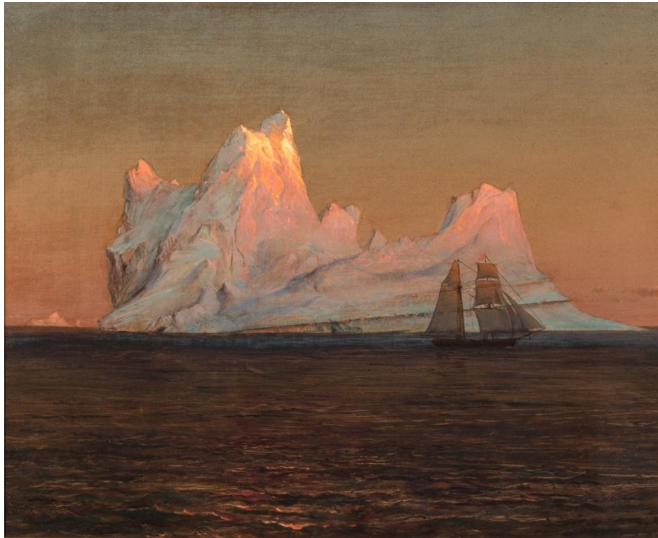
Frederic Edwin Church, The Iceberg , c. 1875. Oil on canvas, 22 x 27 in. (55.9 x 68.6 cm). Terra Foundation for American Art, Chicago.