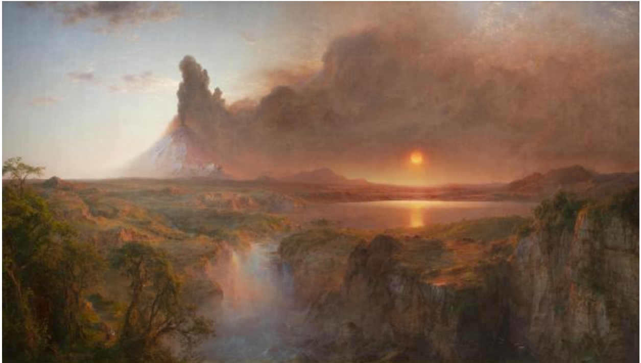
Frederic Edwin Church, Cotopaxi, 1862. Oil on canvas, 48 × 85 in. (121.9 × 215.9 cm). Detroit Institute of Arts

Church's approach to landscape continues to inspire contemporary painters, photographers, filmmakers, and environmental artists. Olana's fusion of architecture and landscape also informs today's conversations about sustainable design, place-making, and the relationship between built and natural environments. His vision remains a touchstone for artists, environmental thinkers, public historians, and cultural institutions.