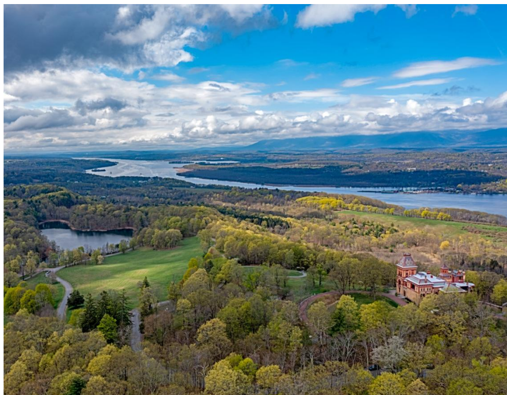
View of Olana

Yearlong Celebration of Exhibitions, Programs, and Publications Honoring America's Greatest Landscape Artist and His Global Vision kicks off Spring 2026