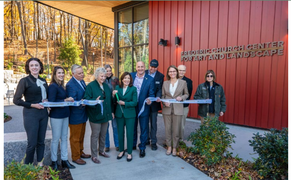
Contributed staff photo

The Olana Partnership and OPRHP combine their strengths and resources to provide learning and enjoyment for the public and the best possible stewardship of the site.