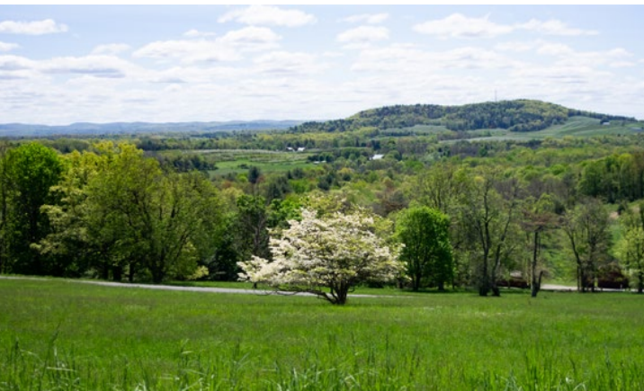
Contributed staff photo