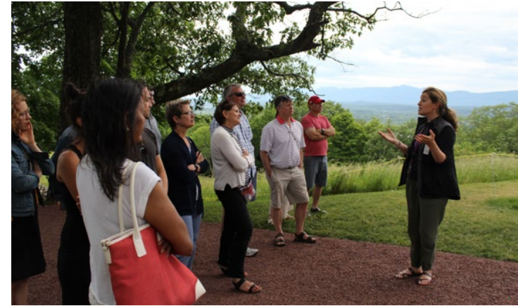
Contributed staff photo

Visitor surveys, academic connections, and digital reach show more people experiencing and understanding Olana as a unified work of landscape art and design.