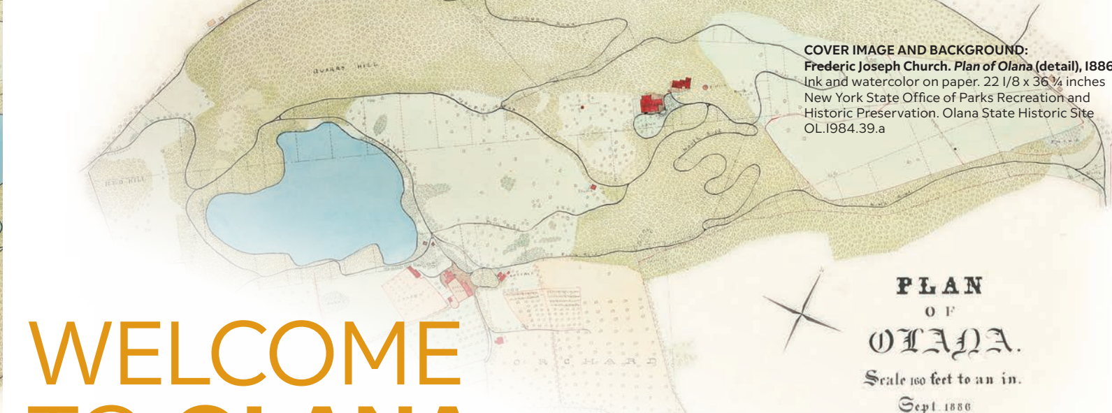
COVER IMAGE AND BACKGROUND: Frederic Joseph Church. Plan of Olana (detail) , 1886 Ink and watercolor on paper. 22 1/8 x 36 1/4 inches New York State Office of Parks Recreation and Historic Preservation. Olana State Historic Site OL.1984.39.a