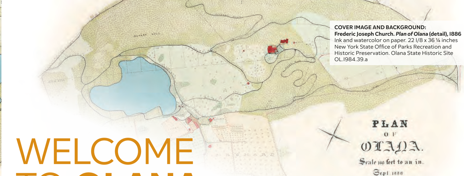
COVER IMAGE AND BACKGROUND: Frederic Joseph Church. Plan of Olana (detail), 1886 Ink and watercolor on paper. 22 1/8 x 36 1/4 inches New York State Office of Parks Recreation and Historic Preservation. Olana State Historic Site OL.1984.39.a