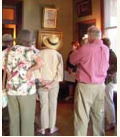
Member's Reception