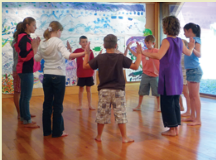
The Journey at the Wagon House Education Center.